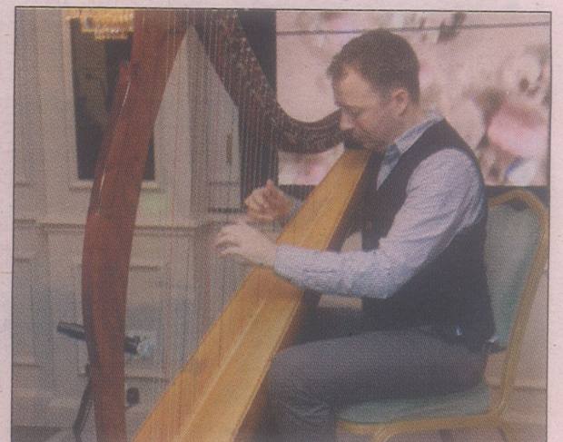
A little heavenly music didn't go amiss.