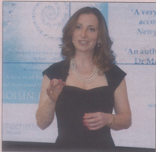
The author addresses the launch gathering.